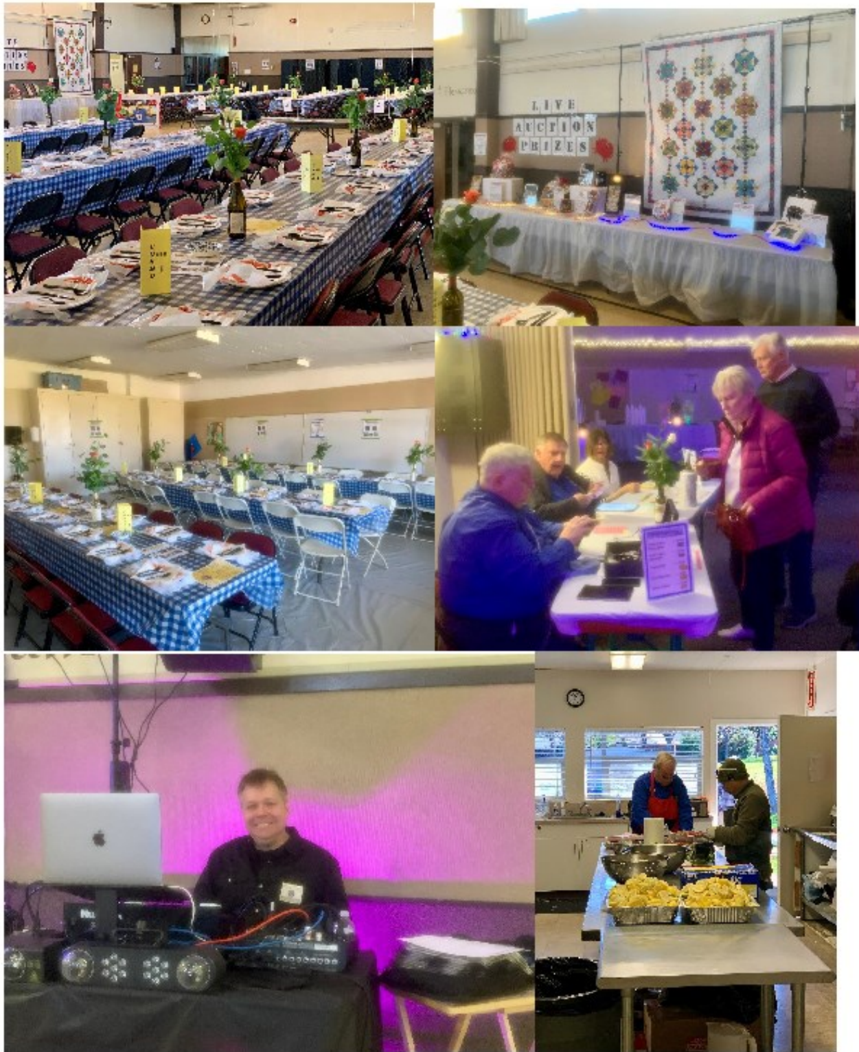
Council Crab Feed—10 February 2024