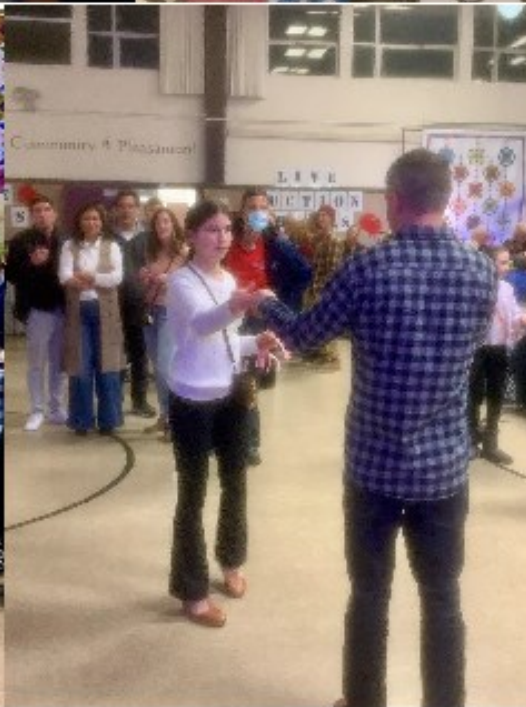
More Crab Feed