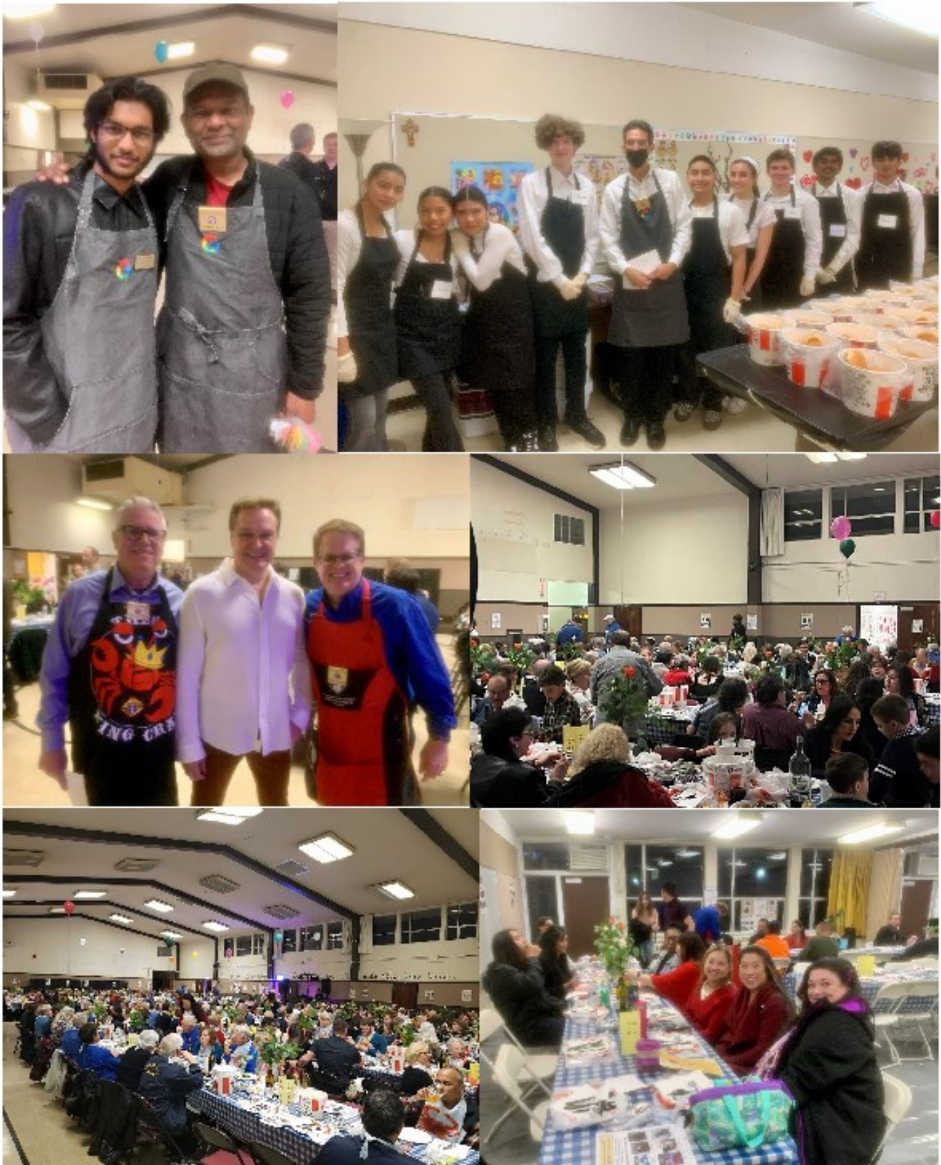
More Crab Feed