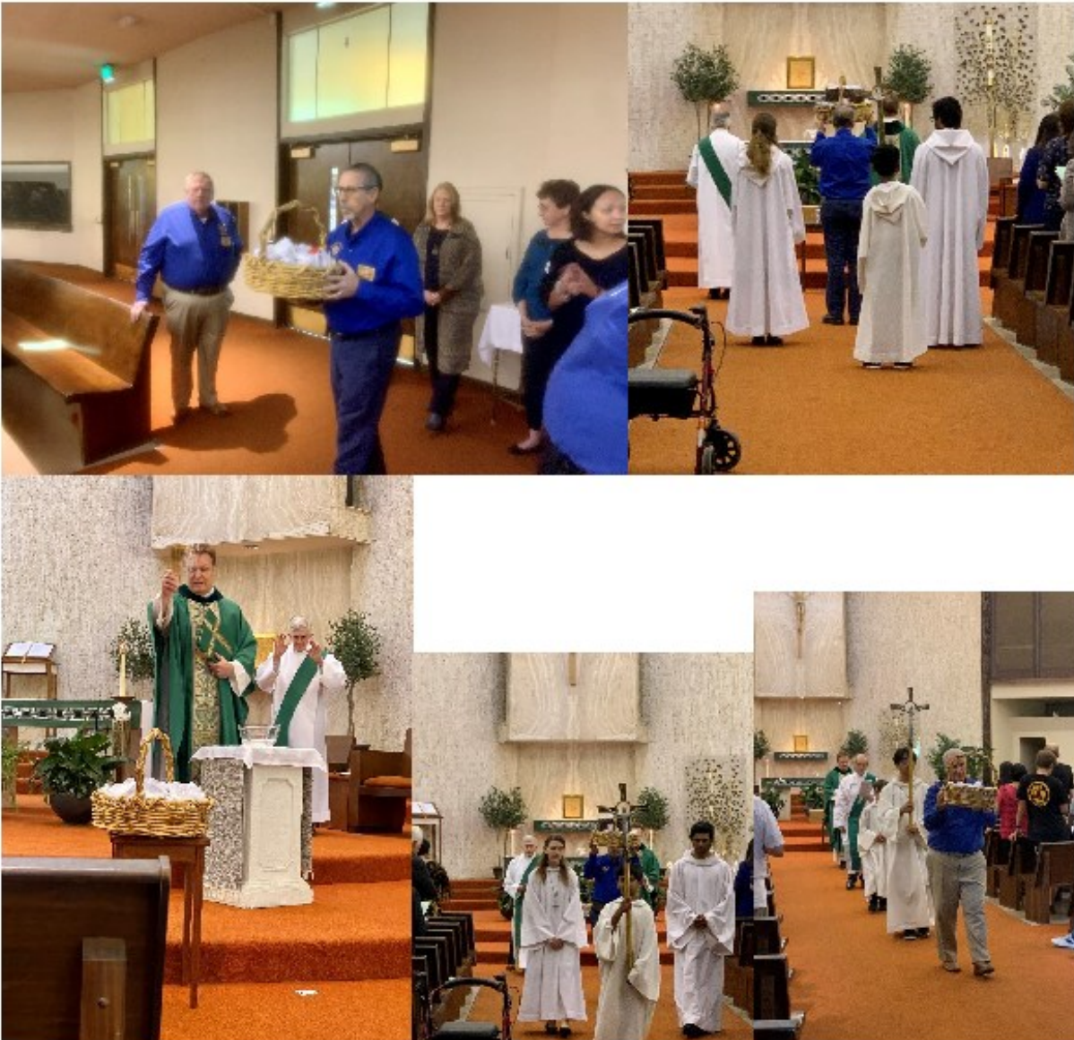
Blessing of Rosaries prior to Distribution by Council Brothers