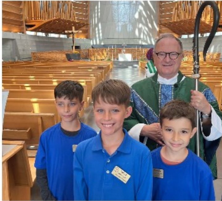
Taize Mass Setup