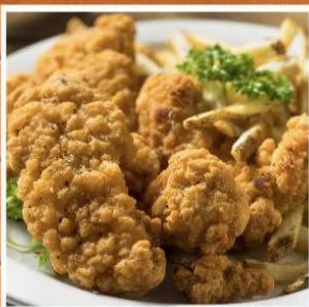
KIDS CHICKEN TENDER