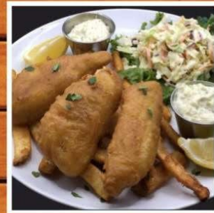
BEER BATTERED FISH AND CHIPS