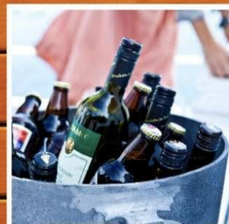
BEER AND WINE