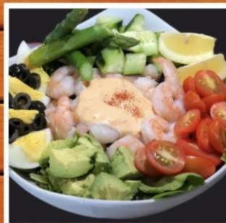
SHRIMP LOUISE SALAD