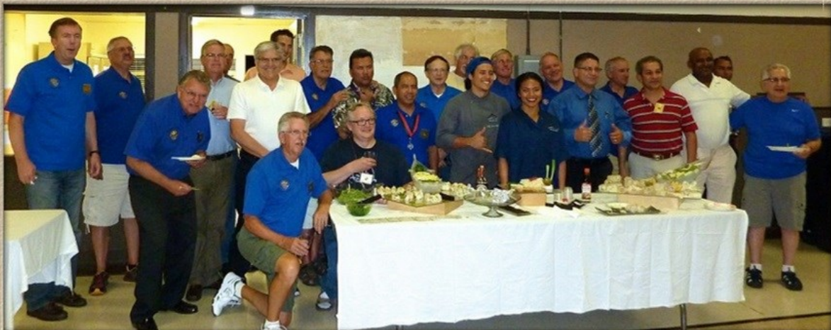
Enjoying A Buffet Dinner After Our Business Meeting On 08-14-2014

See the Council Web Site at www.kofc6043.org for more