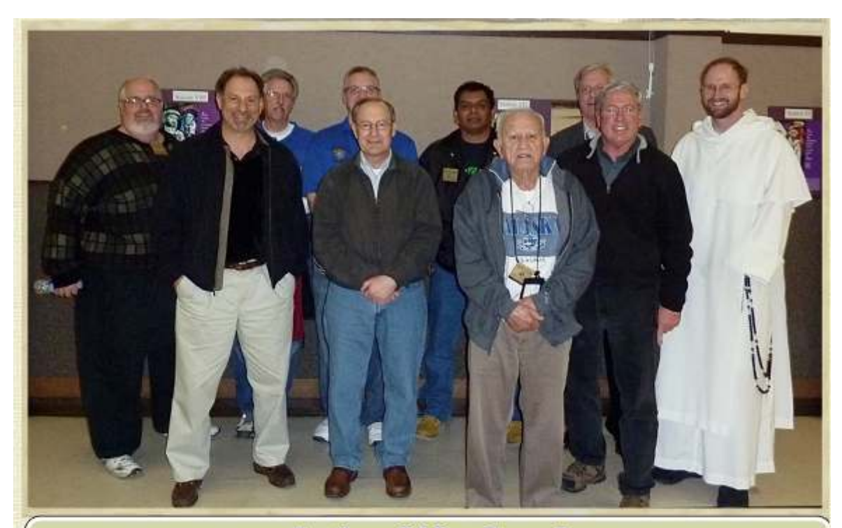
Brothers Of Our Council Who Took Their Second Degree, March 11, 2010